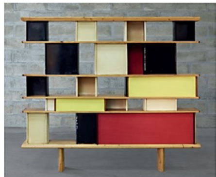
Left: Charlotte Perriand, 'Mexico' bookshelf, c.1953, 5ft 3in (1.6m) high, £120,000 from Galerie Downton at PAD .