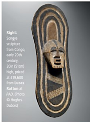
Right: Songye sculpture from Congo, early 20th century, 20in (51cm) high, priced at £19,600 from Lucas Rattton at PAD .

A glance over the new exhibitors takes in Finch & Co (UK) with their signature 'Cabinet of Curiosities' stand, featuring