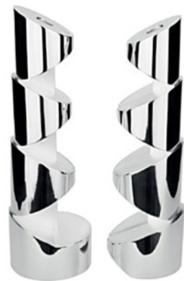
Above: Trenza candlesticks, sterling silver, 14in (36cm) high, limited edition of eight pieces, by Juan and Paloma Garrido, £20,000 from Garrido Gallery at PAD .

Here are some stats: 62 exhibitors, all European with a couple from the USA and