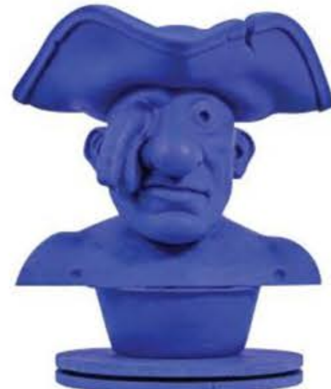
Oh, eye say: Paul McCarthy's Dick Eye, 2002, in blue silicone, is 56cm tall. Find it at Hauser & Wirth