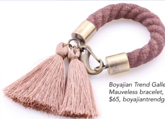
Boyajian Trend Gallery Mauveless bracelet, $65, boyajiantrendgallery.com

If these candleholders look ready for take-off, there's good reason: the designers, David Raffoul and Nicolas Moussallem, sought inspiration from rockets bounding into intergalactic space. These striking sculptures are made to encourage the discovery of beautiful realms with or without the candle, but infused with light they take on another dimension. Handmade of nobly appointed Carrara marble and polished brass, these night lights shine very bright. "Explorer Candles" by David/Nicolas, $900, davidandnicolas.com