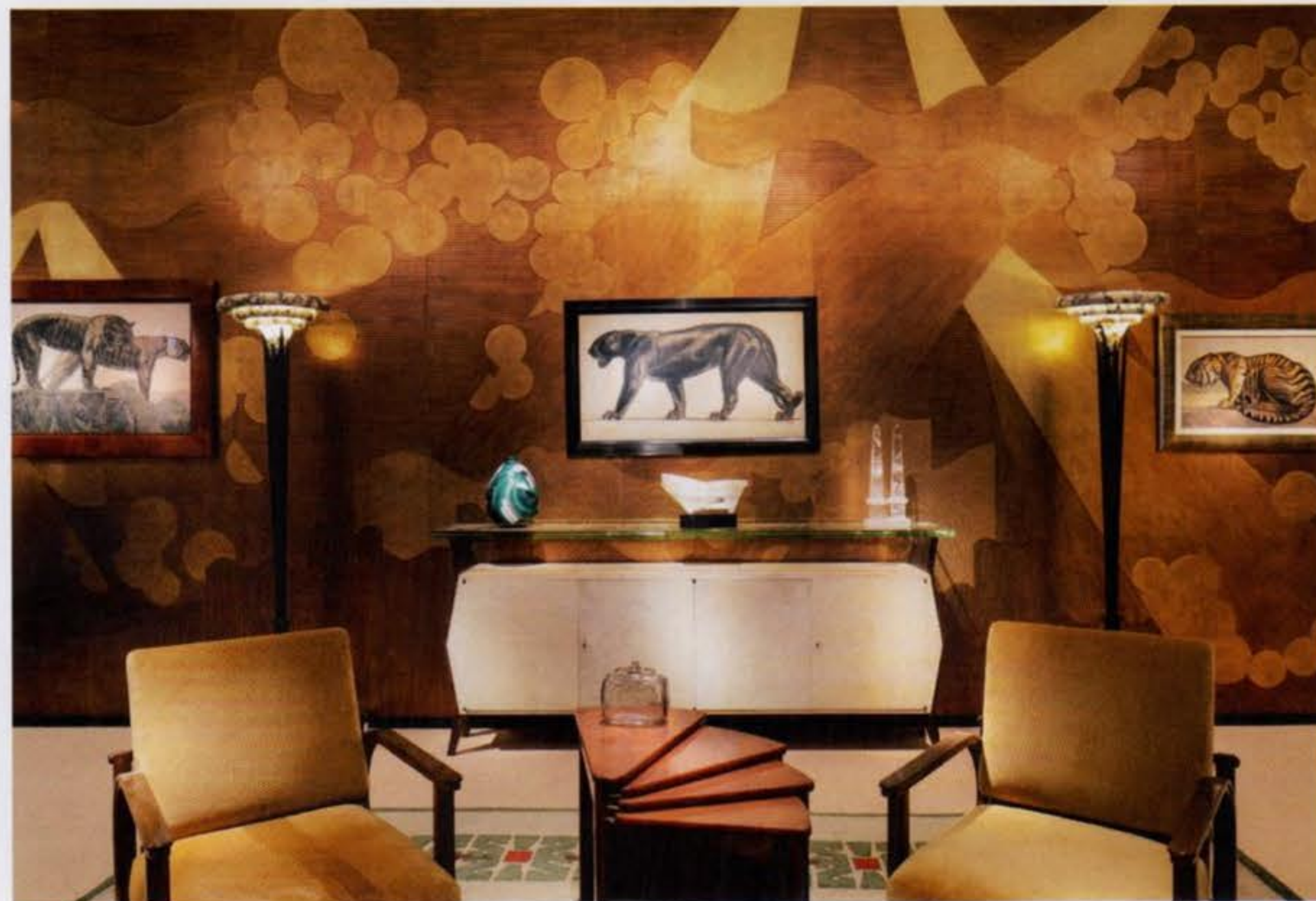
Right: Galerie Marchilac, a 20th century decorative arts specialist