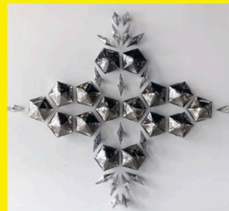
Heller Gallery Joanna Manousis, Chrysalis (Morpho Eugenia) , mold-blown glass, mirror, stainless steel, aluminum, 2020