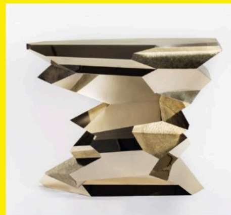
Garrido Gallery Folds console table, Folds Collection, 2020

Galleries and partners highlight what they would have exhibited at this year's fair