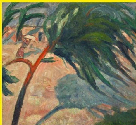
ABA Gallery Mikhail Larionov, Lady with Umbrella , oil on canvas, double-sided, 1910